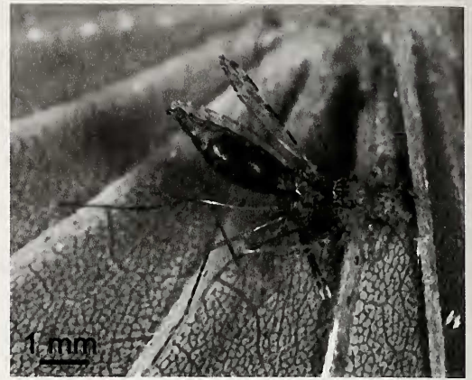
Figure 1.—Small juvenile of Evarcha culicivora feeding on female mosquito ( Anopheles gambiae ). After attacking by grabbing hold of mosquito's posterior ventral thorax from underneath, the salticid has now shifted to feeding from the side of mosquito's thorax.

General. —All testing was carried out between 0700 and 1900 h (laboratory photoperiod 12L:12D, lights on at 0700) at the Thomas Odhiambo Campus (Mbita Point) of the